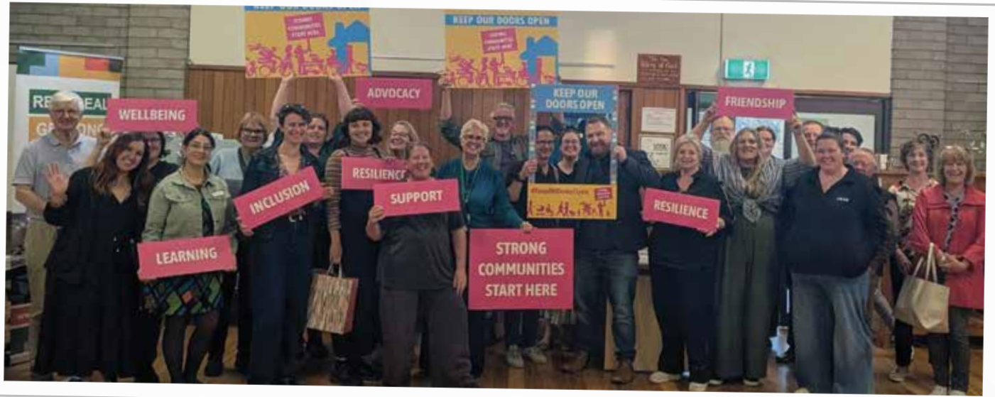
Attendees at the Cloverdale Community Centre annual general meeting joined together to show support for the Neighbourhood Houses Victoria campaign for better funding.