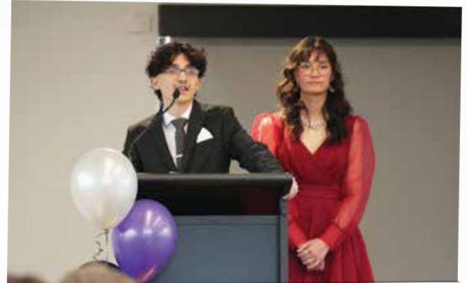
Northern Bay P-12 College celebrated the Class of 2025 at the Year 12 Graduation Dinner at the Shell Club. The evening brought together students, families, and staff to acknowledge 13 years of learning, growth, and achievement.

Graduates were recognised not only for their academic efforts, but for their resilience, leadership, and contributions to the college community. The event was a memorable milestone marking the beginning of exciting new pathways for the young people, and the College extended its warmest congratulations to all Year 12 students on their accomplishment.