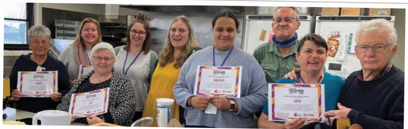
Norlane Community Centre celebrated National Volunteer Week by presenting Certificates of Appreciation to its team of much-valued volunteers.