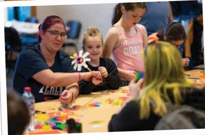
Rosewall Community Centre recently held a successful open day, where community members of all ages enjoyed a range of activities. For information about programs at Rosewall, SEE pages 28 and 29.