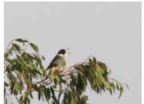
A butcherbird hollers 'pick up your rubbish!'