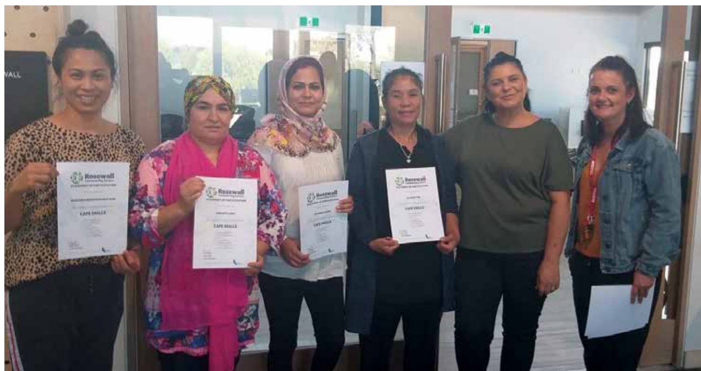
Café Skills students celebrate their graduation at Rosewall Community Centre.