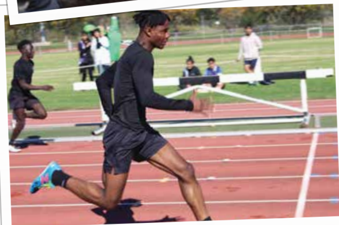
Northern Bay College students were involved in the college's Athletic Carnival in Term 2.

As well as participating in a broad range of athletics events, all campuses had a flag waving song during their celebrations to also celebrate Harmony Day.