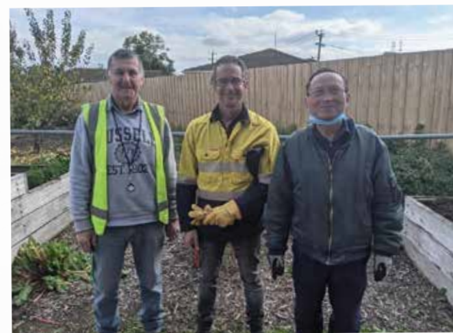
The gardens surrounding Cloverdale Community Centre have been receiving some much-needed attention thanks to a team of volunteers. In addition, a gardening group for wellbeing gets together every Wednesday morning. New members are welcome.