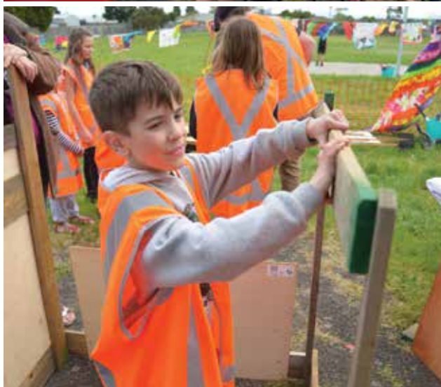
Kids' Urban Dreaming activities will continue at Cloverdale Community Centre in 2018.

MatchWorks TO FIND GREAT STAFF AT NO COST