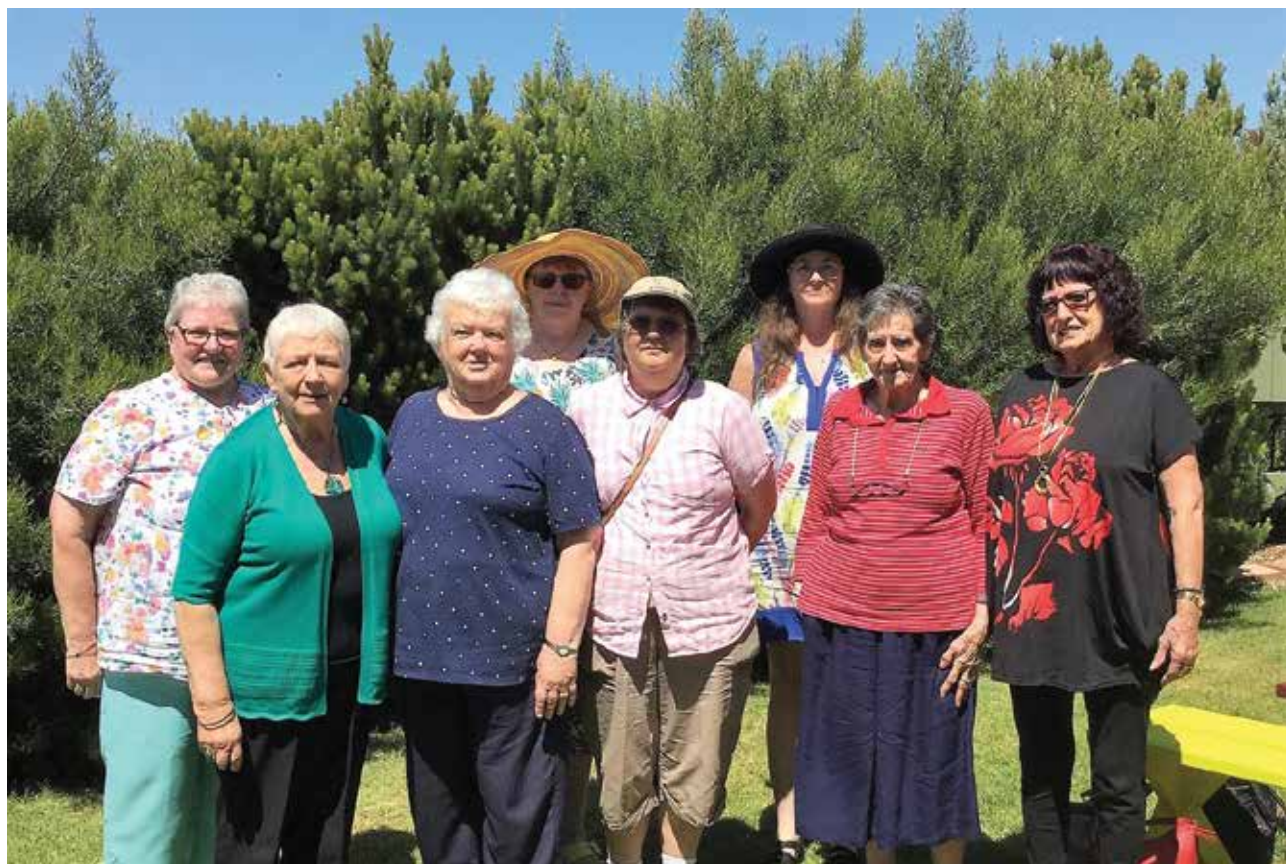
Norlane Community Centre craft group members recently made the trip to Cottage by the Sea at Queenscliff.

The group has been donating for some time now and makes the trip to Cottage By The Sea a few times a year.