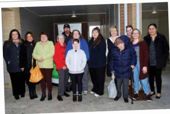
Baptcare has opened the first 20 of its affordable housing units in Eagle Parade. Norlane locals and residents of the new affordable houses were guests at the opening ceremony.