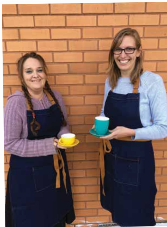
Baptcare is opening a pop-up café at its Robin Avenue site. The café is named The Little Birdy Pop-Up Café and will serve coffee, food and drinks.