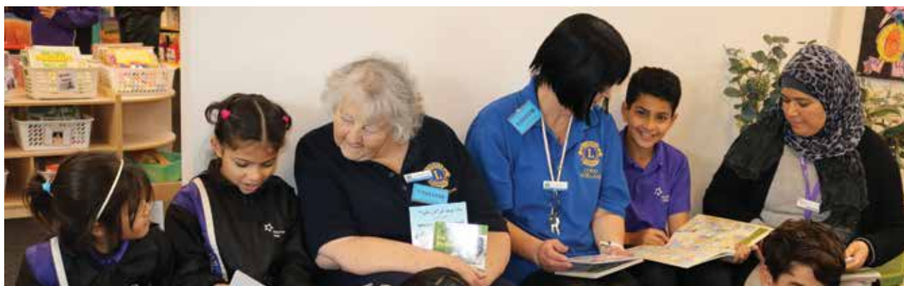
Lions Club members read with students at Northern Bay College.

The Lions Club of Corio Norlane recently celebrated its fifth birthday. To celebrate the milestone and in line with its community work, members decided that the best presents were the ones you give.