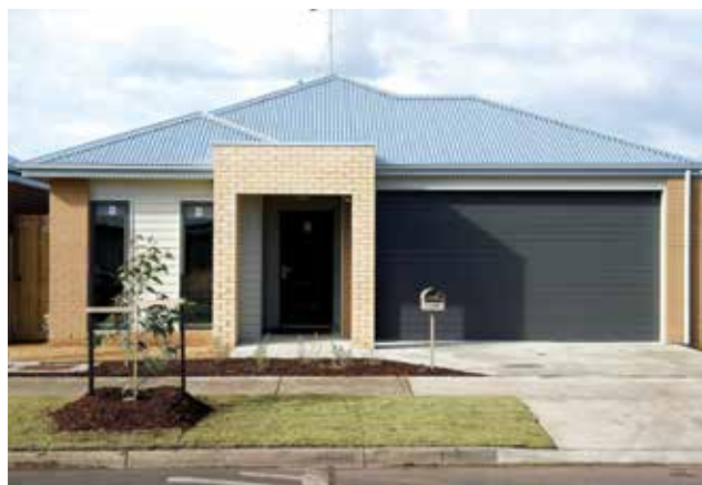
The new affordable houses.