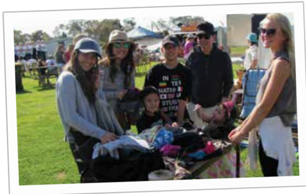
The Rosewall Neighbourhood Centre's Twilight Market was a popular community event. Market visitors enjoyed the range of stalls, food and activities. The centre will host a festival on Saturday, March 4 with another array of activities and entertainment lined up.