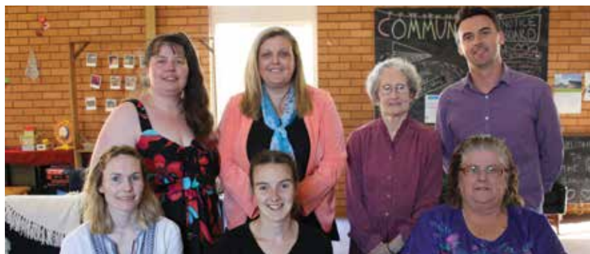
Baptcare Norlane Project Reference Group members been busy.

The Baptcare Norlane Project Reference Group has been busy lately. Members of the reference group have been meeting regularly and making important decisions about the site.