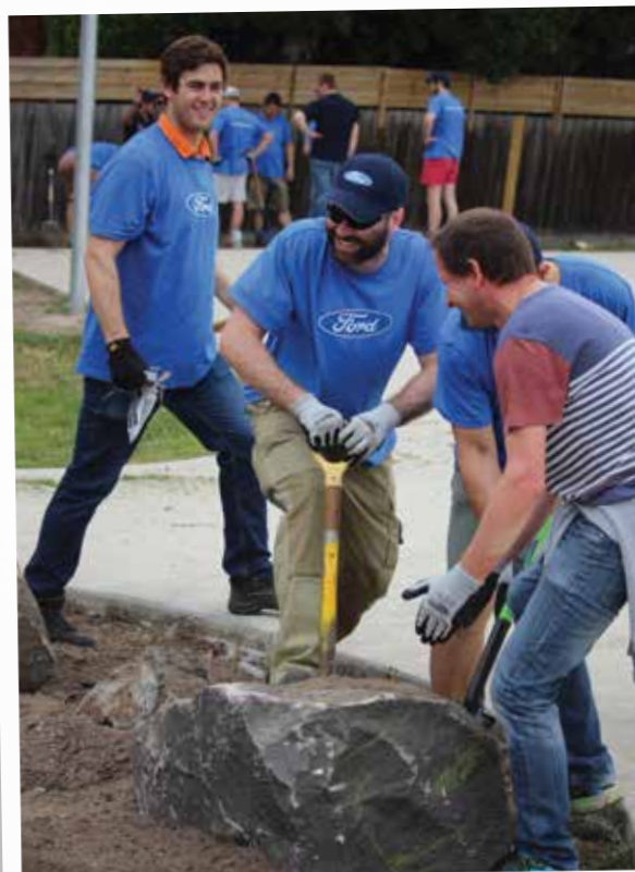
A group of Ford workers made a difference at Northern Bay College's Peacock campus as part of Volunteer Corp.