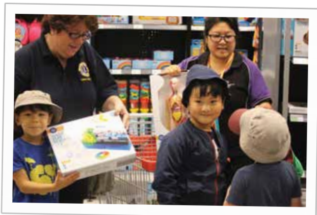
The Lions Club of Corio Norlane recently donated toys to the Northern Bay College Early Learning Centre. Children at the centre had fun helping to select the toys.