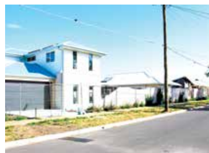
Stage 1 of the development features affordable rental houses in Eagle Parade.

Stage 1 of the development is underway and it won't be long until local residents see people starting to move into some of the affordable rental houses in Eagle Parade. This will happen around March.