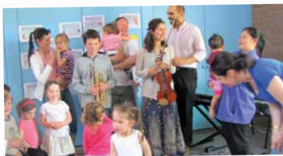
Rosewall Neighbourhood Centre's Big Concert For Little People was well attended by local residents. Families enjoyed a range of musical and fun activities.