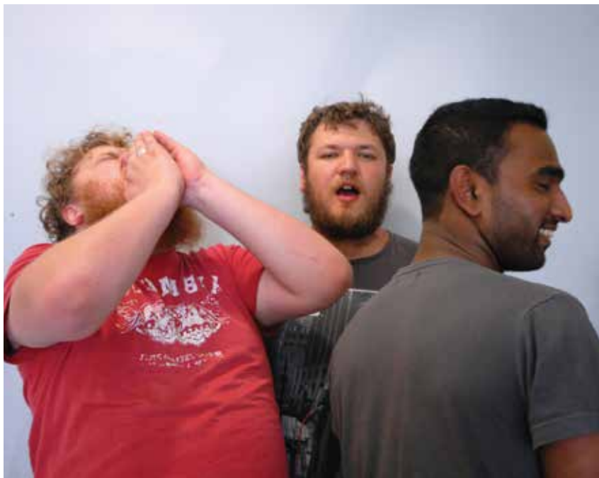
Cloverdale's Noise Scavengers rehearse for their Melbourne performance.