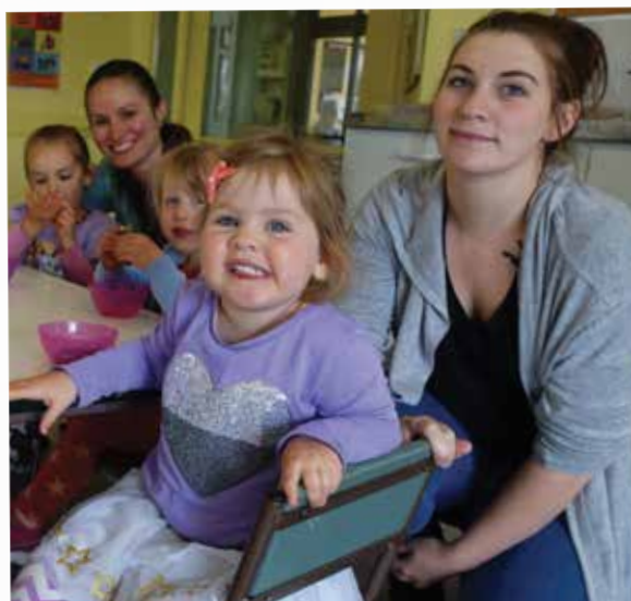
Cloverdale Community Centre hosts friendly playgroups for families every Wednesday from 9.30am until 11.30am and Friday from 10am until noon. The cost is $2 per session.