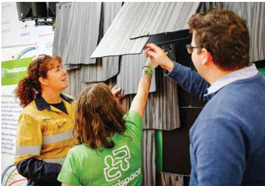
Members of the community were invited to tear down a piece of wall, representing the stigma associated with mental health, as part of headspace activities.

In addition, the Geelong community helped tear down the "Big Stigma" as part of headspace's Mental Health