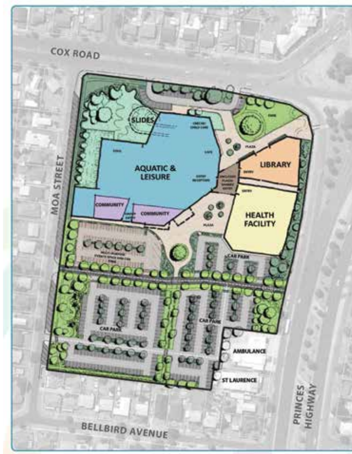
The Masterplan overview of the Northern ARC hub.