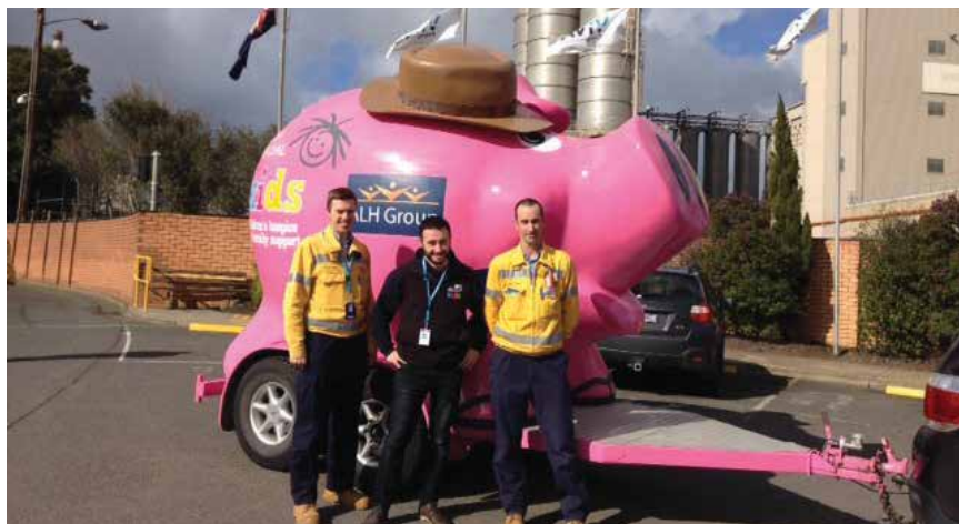
The Very Special Kids charity benefits from every Goal Zero day at Viva Energy.

Very Special Kids is a children's charity that helps more than 900 families across Victoria who have a child with a life-threatening condition, with ongoing support from diagnosis all the way through to recovery or bereavement.