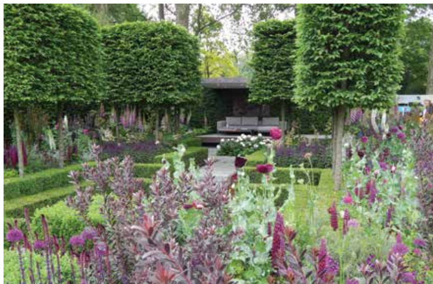
Australian entry: The Australian entry in the Chelsea Flower Show featured clipped hedges and square trees.

The pavilion, which showcased new and improved floral stock, was great and included the biggest sneaker I've ever seen – at least two-and-a-half metres in length and made entirely of flowers. The displays were superb and I would have loved to bring quite a few of them home – I did bring some sweet pea seeds (which had been properly