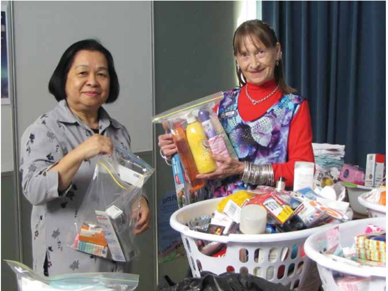
Rosewall Neighbourhood Centre staff and volunteers are supporting The Road Home Project's hygiene products appeal.

The Corio Norlane Lions Club and other local community groups are continuing their commitment to The Road Home Project, which is dedicated to creating a better outcome and understanding for those experiencing homelessness.