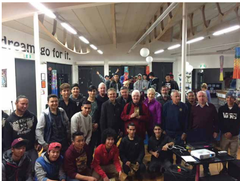
Futsal participants and Rotary Club of Corio Bay members at their recent dinner at The fOrt.

Some of the participants of the Multicultural Futsal League attended a thank you dinner for the Rotary Club, held at The fOrT in St Georges Road. Participation in this league has created new friendships and an immense amount of fun.