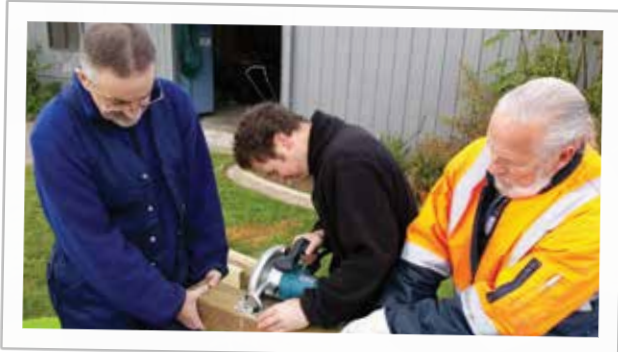
New garden beds have been created by a team of volunteers at Rosewall Neighbourhood Centre.