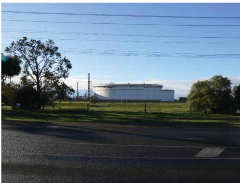
Artist's impression of the crude tank.

Viva Energy will work to minimise the impact on neighbours over this period.