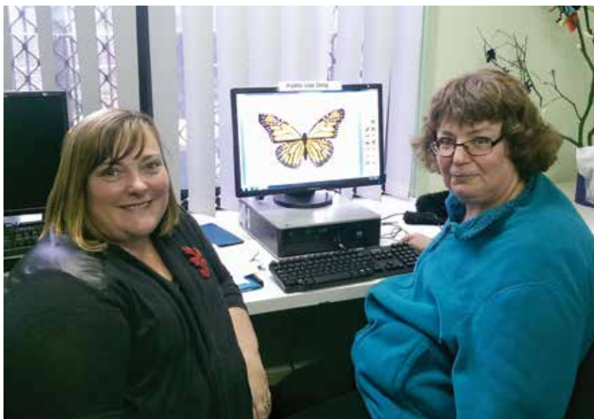
The Year of Digital Inclusion is being celebrated with a range of activities at Cloverdale Community Centre.