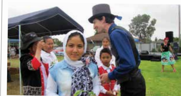
Rosewall Neighbourhood Centre recently hosted its annual Going Potty festival. The day included a wide range of activities and attracted visitors of all ages to the centre.