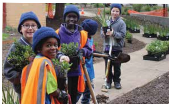
Bunnings North Geelong staff had a big impact when they came to plant with the Preps at Northern Bay College Hendy campus.