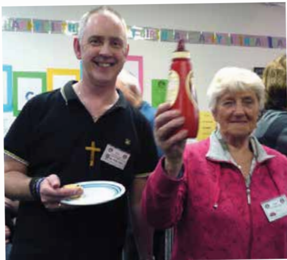
The Listening Lounge at Corio Shopping Centre recently celebrated its 17th birthday with a morning tea. The lounge is sponsored by centre management and local Christian churches.