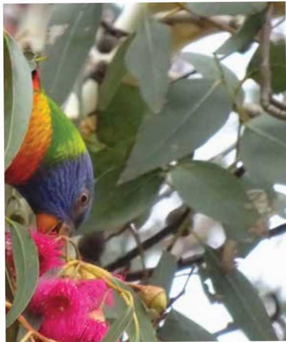
Beautiful rainbow lorikeets enjoy the gum trees at Stead Park.