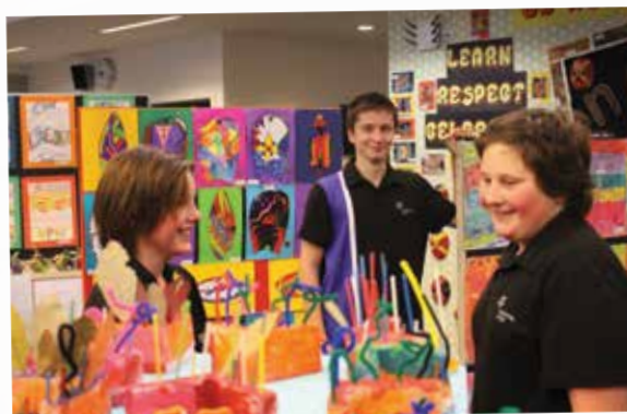
Northern Bay College students enjoy some of the work at the school's recent art show.